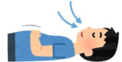
QUIET MY MIND...