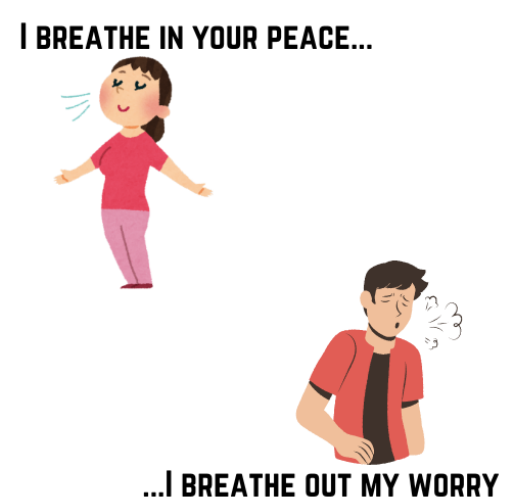
FORGIVE ME GOD...