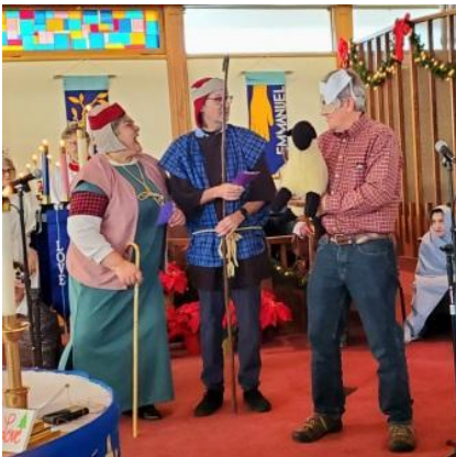
The shepherds declare to go see baby Jesus and pay him homage