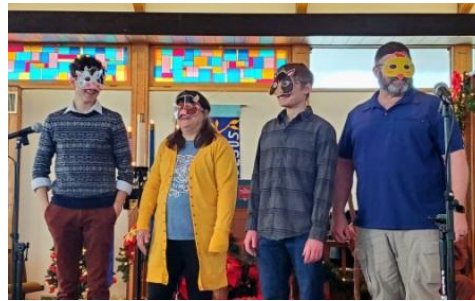
Even the animals rejoice