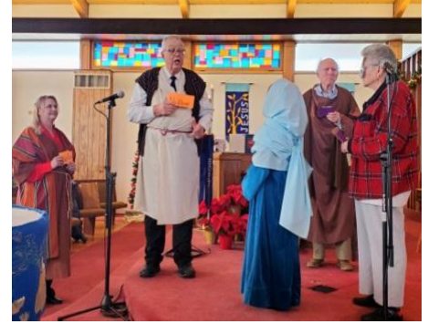
The Innkeeper has no room