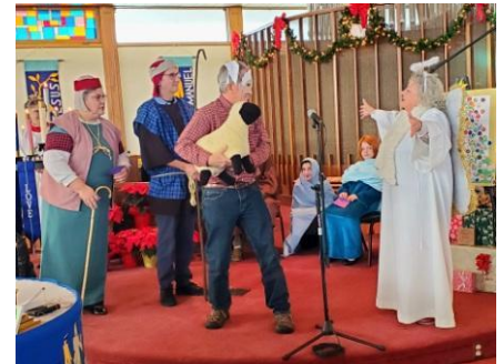
An angel visits the shepherds