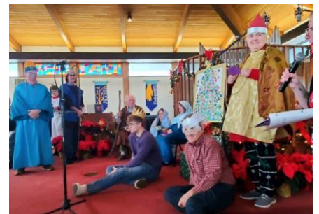
The Magi present gifts