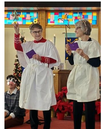
The stars show the way