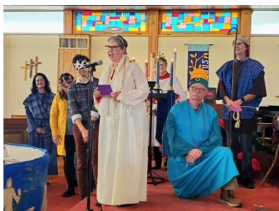
An angel speaks to the Magi