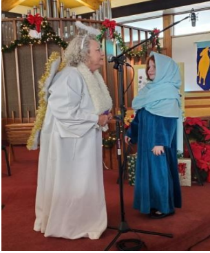
Mary is visited by an angel