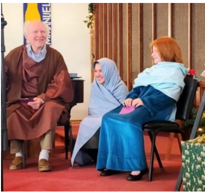
The baby Jesus is born